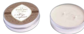
Eco-candle «Coffee with cinnamon»