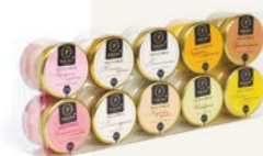
Shipping box Plastic box 10 x 30 ml

Article: 86 Region: Central Russia Glass jar with clips 210 g. Jars in package: 6 Glass jar 30 g. Jars in package: 10