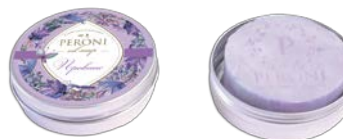
Honey soap «Provence»