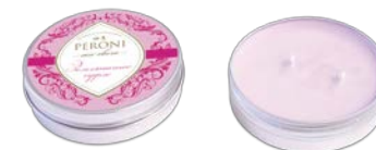
Eco-candle «Strawberry mousse»