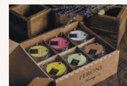
Shipping box Corrugated box 6 x 250 ml