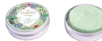
Honey soap «Mint Morning»