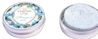
Honey soap «Vanilla Sky»