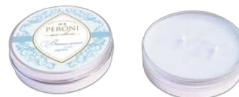
Eco-candle «Vanilla Sky»