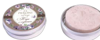
Honey soap «Coffee with cinnamon»