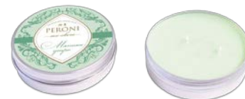
Eco-candle «Mint Morning»