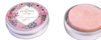
Honey soap «Strawberry mousse»