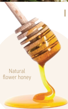
Natural flower honey