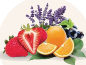
Dried berries nuts, fruits, spice