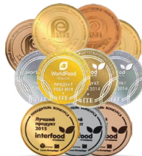
11 medals Product of the Year