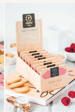
Carton, 8 boxes