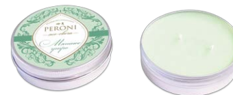
Eco-candle «Mint Morning»