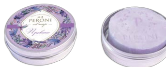
Honey soap «Provence»