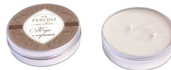
Eco-candle «Coffee with cinnamon»