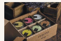
Shipping box Corrugated box 6 x 250 ml