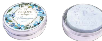
Honey soap «Vanilla Sky»