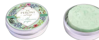
Honey soap «Mint Morning»