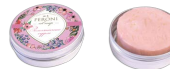
Honey soap «Strawberry mousse»