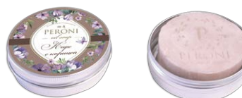
Honey soap «Coffee with cinnamon»