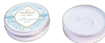
Eco-candle «Vanilla Sky»