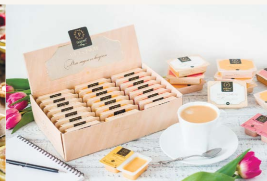
Carton, 24 boxes