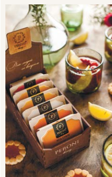
Wooden, 8 boxes

To make it convenient to sort out the honey on the shelf, showcase or on the table we have prepared for you a variety of show-boxes for portioned honey-soufflé.