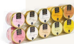
Shipping box Plastic box 10 x 30 ml

Article: 86 Region: Central Russia Glass jar with clips 210 g. Jars in package: 6 Glass jar 30 g. Jars in package: 10