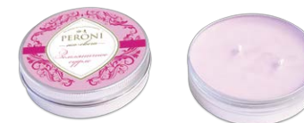
Eco-candle «Strawberry mousse»